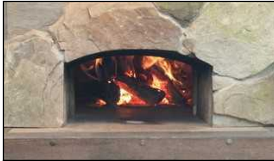
BOB'S OUTDOOR WOOD-FIRED OVEN