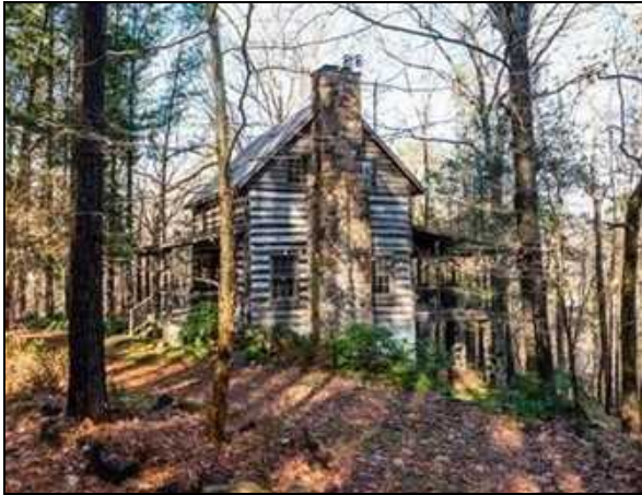
LYNCH CREEK FARM CABIN

URBAN ELEGANCE • RURAL CHARM • SUSTAINABLE AND ORGANIC FOODS