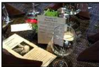
PHILADELPHIA STYLE WITH CAROLINA CHARACTER

BUSINESS MEETINGS IN A RURAL SETTING WITH URBAN CONVENIENCES