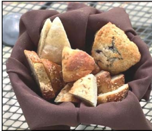
FRESH ARTISAN BAKERY BREADS