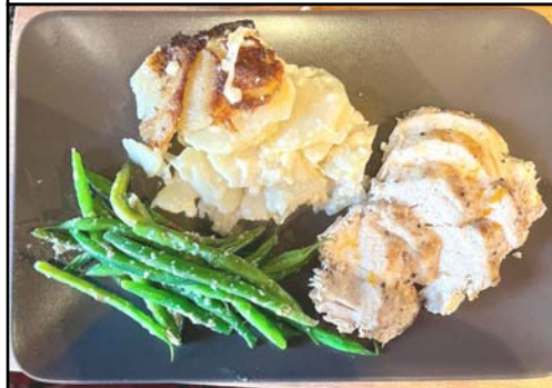
DELICIOUS MAIN COURSES