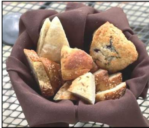
ARTISAN BAKERY BREADS