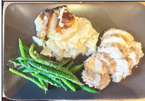
DELICIOUS MAIN COURSE