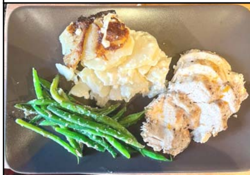
TYPICAL DINING MENU