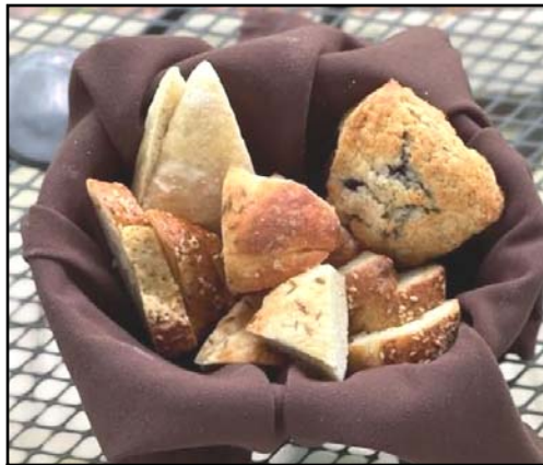
FRESH ARTISAN BAKERY BREADS