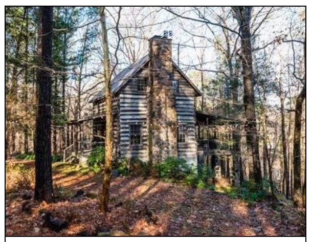
LYNCH CREEK FARM CABIN CLICK IMAGE TO GOOGLE MY BUSINESS

WELCOME TO LYNCH CREEK FARM AN EXCEPTIONAL BUSINESS MEETING, DINING AND ENTERTAINMENT VENUE RECOGNIZED BY THE RALEIGH NEWS & OBSERVER (N&O) AS THE "BEST KEPT SECRET IN FRANKLIN COUNTY"