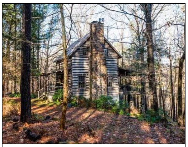
LYNCH CREEK FARM CABIN CLICK IMAGE TO GOOGLE MY BUSINESS

WELCOME TO LYNCH CREEK FARM AN EXCEPTIONAL BUSINESS MEETING, DINING AND ENTERTAINMENT VENUE RECOGNIZED BY THE RALEIGH NEWS & OBSERVER (N&O) AS THE "BEST KEPT SECRET IN FRANKLIN COUNTY"