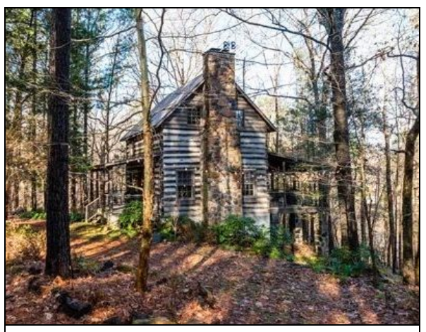
LYNCH CREEK FARM CABIN CLICK IMAGE TO GOOGLE MY BUSINESS

WELCOME TO LYNCH CREEK FARM AN EXCEPTIONAL BUSINESS MEETING, DINING AND ENTERTAINMENT VENUE RECOGNIZED BY THE RALEIGH NEWS & OBSERVER (N&O) AS THE "BEST KEPT SECRET IN FRANKLIN COUNTY"