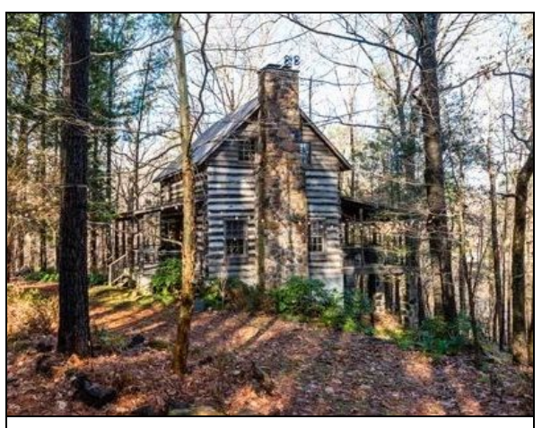
LYNCH CREEK FARM CABIN CLICK IMAGE TO GOOGLE MY BUSINESS

WELCOME TO LYNCH CREEK FARM AN EXCEPTIONAL BUSINESS MEETING, DINING AND ENTERTAINMENT VENUE RECOGNIZED BY THE RALEIGH NEWS & OBSERVER (N&O) AS THE "BEST KEPT SECRET IN FRANKLIN COUNTY"