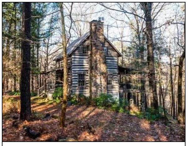
LYNCH CREEK FARM CABIN CLICK IMAGE TO GOOGLE MY BUSINESS

WELCOME TO LYNCH CREEK FARM AN EXCEPTIONAL BUSINESS MEETING, DINING AND ENTERTAINMENT VENUE RECOGNIZED BY THE RALEIGH NEWS & OBSERVER (N&O) AS THE "BEST KEPT SECRET IN FRANKLIN COUNTY"