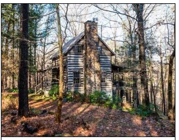
LYNCH CREEK FARM CABIN CLICK IMAGE TO GOOGLE MY BUSINESS

WELCOME TO LYNCH CREEK FARM AN EXCEPTIONAL BUSINESS MEETING, DINING AND ENTERTAINMENT VENUE RECOGNIZED BY THE RALEIGH NEWS & OBSERVER (N&O) AS THE "BEST KEPT SECRET IN FRANKLIN COUNTY"