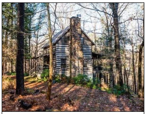
LYNCH CREEK FARM CABIN CLICK IMAGE TO GOOGLE MY BUSINESS

WELCOME TO LYNCH CREEK FARM AN EXCEPTIONAL BUSINESS MEETING, DINING AND ENTERTAINMENT VENUE RECOGNIZED BY THE RALEIGH NEWS & OBSERVER (N&O) AS THE "BEST KEPT SECRET IN FRANKLIN COUNTY"