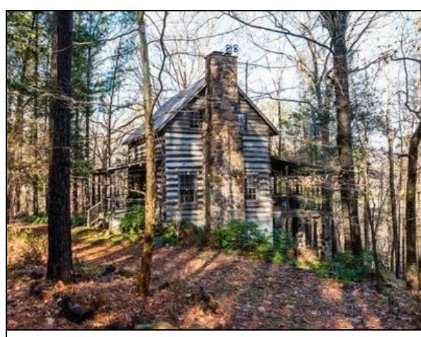
LYNCH CREEK FARM CABIN CLICK IMAGE TO GOOGLE MY BUSINESS

Welcome to <u>Lynch Creek Farm</u> an exceptional Business Meeting, Dining and Entertainment Venue recognized by the Raleigh News & Observer (N&O) as the "<u>Best Kept Secret in Franklin County</u>"