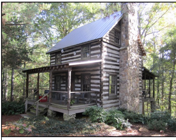
LYNCH CREEK FARM CABIN CLICK IMAGE TO GOOGLE MY BUSINESS

WELCOME TO LYNCH CREEK FARM AN EXCEPTIONAL BUSINESS MEETING, DINING AND ENTERTAINMENT VENUE RECOGNIZED BY THE RALEIGH NEWS & OBSERVER (N&O) AS THE "BEST KEPT SECRET IN FRANKLIN COUNTY"