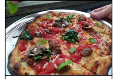
BOB'S WOOD-FIRED OVEN TOMATO PIE FUND-RAISING EVENT

RICK & BETTE NEWSOME BYOB - $20 per person Reservations Required - Rain or Shine