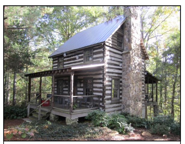
LYNCH CREEK FARM CABIN CLICK IMAGE TO GOOGLE MY BUSINESS

WELCOME TO LYNCH CREEK FARM AN EXCEPTIONAL BUSINESS MEETING, DINING AND ENTERTAINMENT VENUE RECOGNIZED BY THE RALEIGH NEWS & OBSERVER (N&O) AS THE "BEST KEPT SECRET IN FRANKLIN COUNTY"