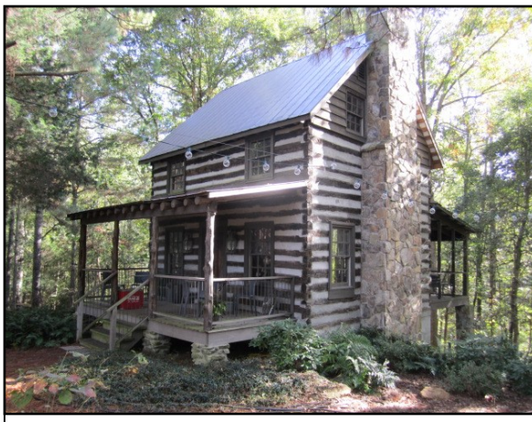
LYNCH CREEK FARM CABIN CLICK IMAGE TO GOOGLE MY BUSINESS

WELCOME TO LYNCH CREEK FARM AN EXCEPTIONAL BUSINESS MEETING, DINING AND ENTERTAINMENT VENUE RECOGNIZED BY THE RALEIGH NEWS & OBSERVER (N&O) AS THE "BEST KEPT SECRET IN FRANKLIN COUNTY"