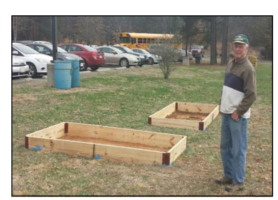
[The progress we made with Student help on February 23^{rd} , 2018 - 9:30am-2:30pm]

Additionally, hands-on Composting will be taught to reinforce the science and importance of recycling and the renewability of our natural resources. ECHS Students will study the economics of recycling waste from their cafeteria.